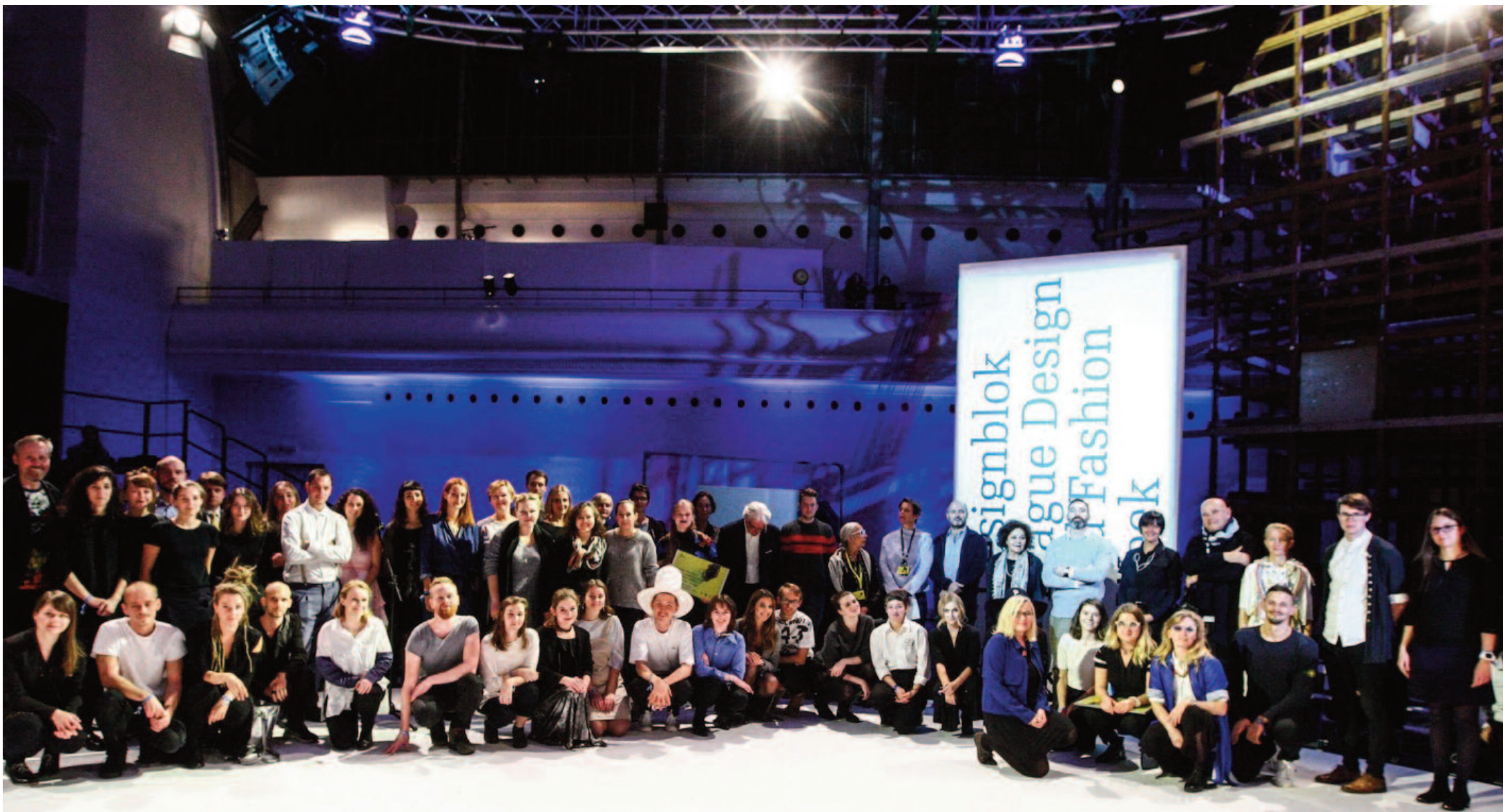
Diploma Selection 2016 finalists